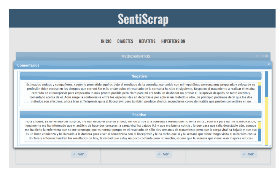
Fig 4. SentiScrap comments modal window

referring to the drug and its classification with respect to whether it is a positive comment or a negative one. Figure 4 shows a modal window with the collected comments.