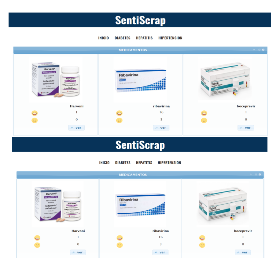
Fig 3. Hepatitis options of the SentiScrap system

A Sentiment Analysis Approach for Drug Reviews in Spanish