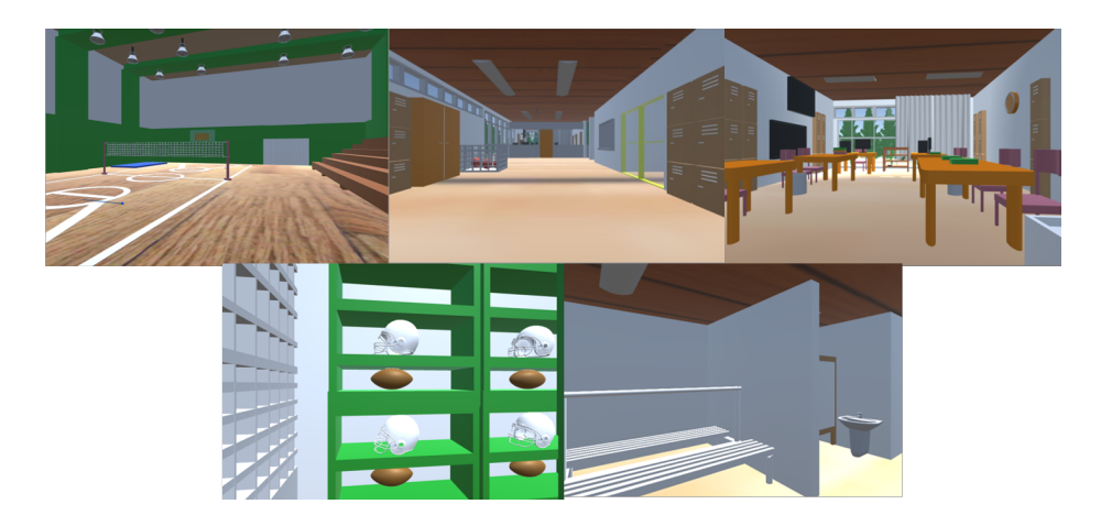
Fig. 3. Virtual environment scenes.

In order to users can move through the virtual environment in a more fluid way, 5 scenes were created between they can move, this is done through contact with a transparent object in which the code was developed to indicate which scene must move when having contact, the scenes in which the environment was divided are gym, hallway, office, men's locker room and women's locker room, each of these allows users navigate, see, touch and interact with different objects (see Fig. 3).