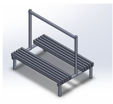
Fig. 1. Benches of men's locker room.