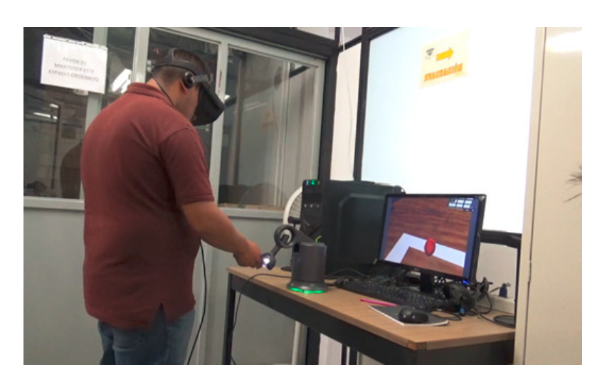
Fig. 4. Subject performing the test.

The tests consisted of taking a free tour of the facilities, the subjects could move, touch and interact with any object in the scenes. At the end they were asked about their experience and how they felt after removing the 3D viewer (see Fig. 4).